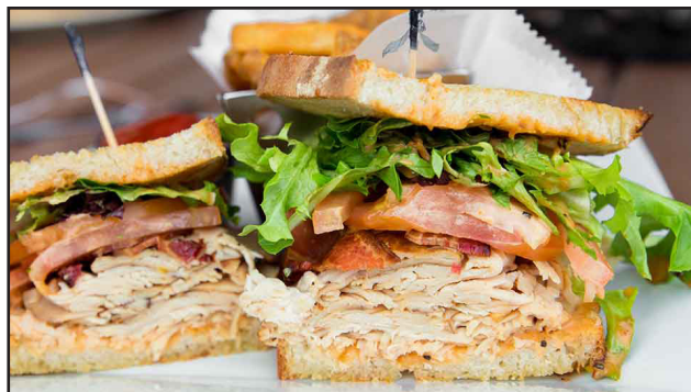
Extensive menu + full bar featuring local beers, wine and speciality cocktails

Dine on our patio with spectacular views of the course and Green Mountains!