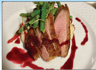
LIVE MUSIC THURS/SUN