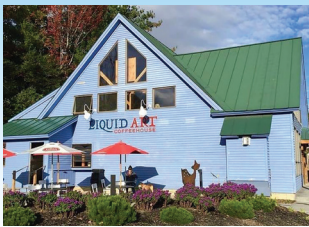
BREAKFAST, LUNCH & DINNER

INTIMATE DINING • ESPRESSO BAR • GALLERY • COCKTAILS